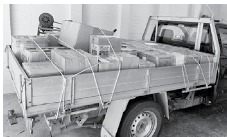
Above the utility loaded with books ready to transport to the docks for shipping to Samoa.

overcome. After thinking we had some space in a container to East Timor and then resultant cancellation of the ship, we obtained news we could send to Samoa in December. This also was cancelled but we eventually received news a ship with space was going to Samoa in February and this did eventuate.