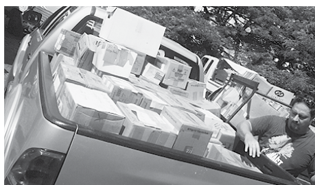
Above books have been collected in Samoa and ready for distribution to village primary schools.

With no hands-on activity in Samoa this Rotary year, the Club agreed to support the Rotary Club of Apia with its student scholarship program. This program supports disadvantaged students with university potential to undertake their final year of study prior to University to ensure the best outcome possible for their acceptance into university studies. An amount of $2,000 was donated which supported 4 students in that program.