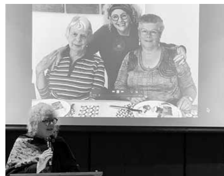
Presenting Starthrower to the Rotary Club of Ocean Grove.

As mentioned, Rotary Clubs of Bendigo, Rochester and Brighton North.