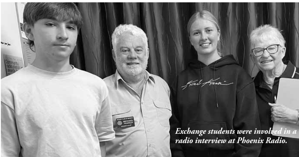
Exchange students were involved in a radio interview at Phoenix Radio.

Some of the students we supported also offered their help at the Rotary Club of Bendigo Carols by Candlelight.