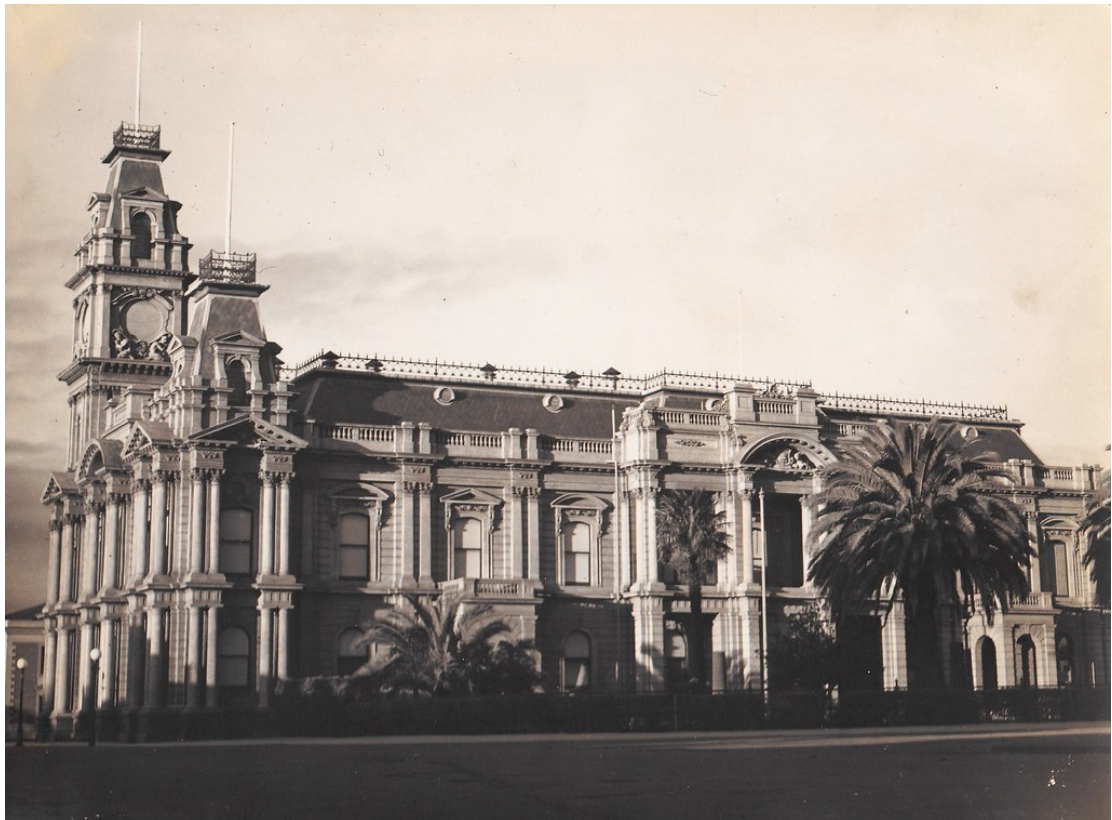
Bendigo Town Hall 1939